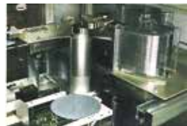
Cassette storage unit