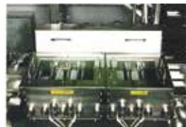
Scrub brush cleaning unit