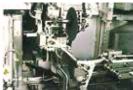
Wafer demounting unit