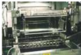
Light cleaning unit