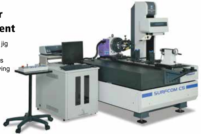
Example for crankshaft