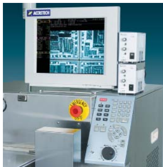
User-friendly Operating Panel