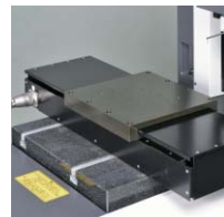
Y-axis CNC table (200mm)