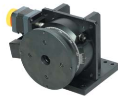
\theta -axis CNC table (vertical)