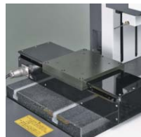
Y-axis CNC table (100mm)