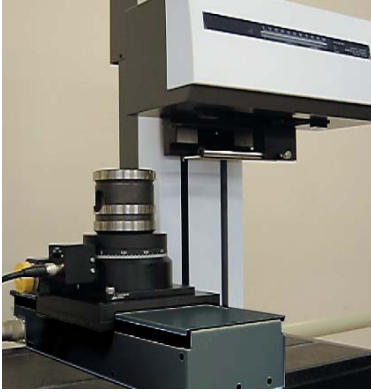
Example of Y-axis CNC table (100mm) and \theta -axis CNC table (horizontal) combination