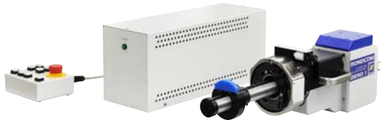
Controller, Operation box